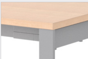
Worksurface available in low and high pressure laminate.