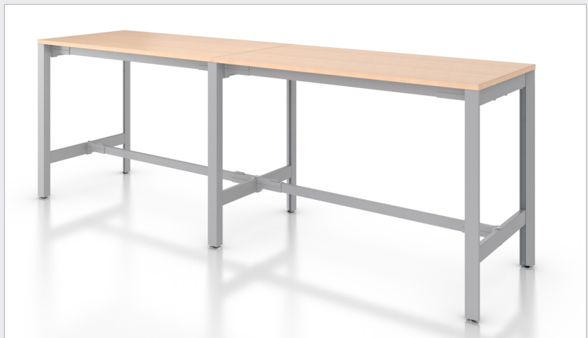
Shared leg assembly