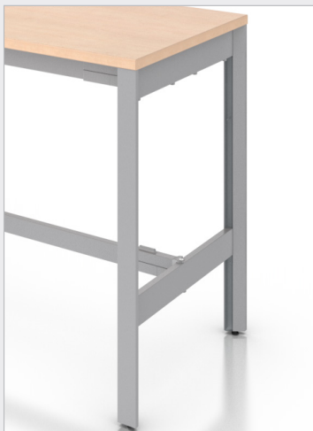
H-leg assembly creates greater stability for higher heights.