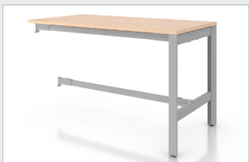
Add-on (BRT36AxxxL) table kit seamlessly connects to existing tables.