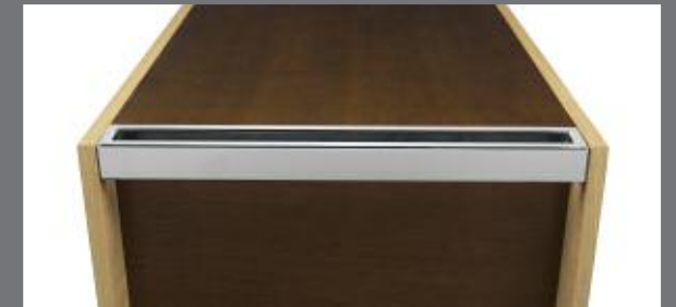
SERVING CART: HANDLE