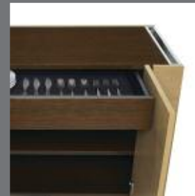
SERVING CART: CUTLERY DRAWER