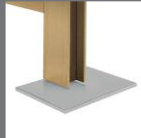
TABLE: BASE AND FOOT