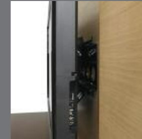
CREDENZA: MONITOR CONNECTION