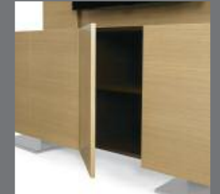
CREDENZA: ADJUSTABLE SHELF