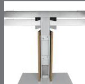
TABLE: HEIGHT ADJUSTABLE LEG