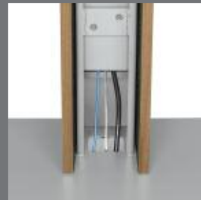
TABLE: WIRE MANAGEMENT