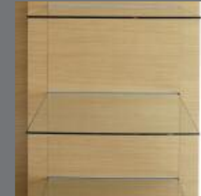
DISPLAY WALL: GLASS SHELF