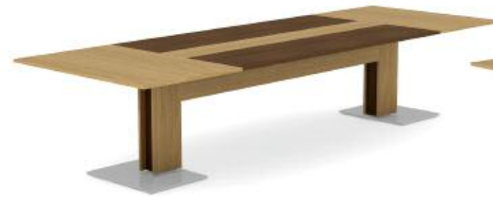
MODULAR WITH TECHNOLOGY TROUGH WITH CONTRASTING DOORS